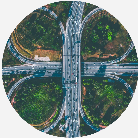
Sign Up With AURA