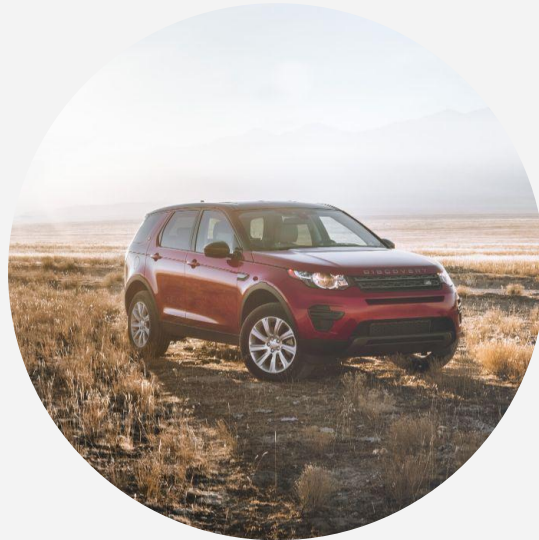
Onboard Your Vehicles